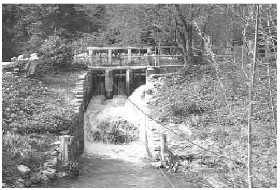
Water rushes through the new stonework and oak structures that make up the new working sluice.

Separately, in a Conservation context, great credit must go to Roger and Jonquil McCullagh at Cliffords Orchards in Kings Mill Lane, who own the mill pond, the sluice structure, and the stonework below it. Even with a grant from DEFRA, the outlay for these materials, plus several weeks' work, must have been substantial, and it forms a generous contribution to the Pains-wick environment. It is well worth a visit