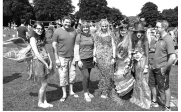
Getting ready for the Art Couture Festival