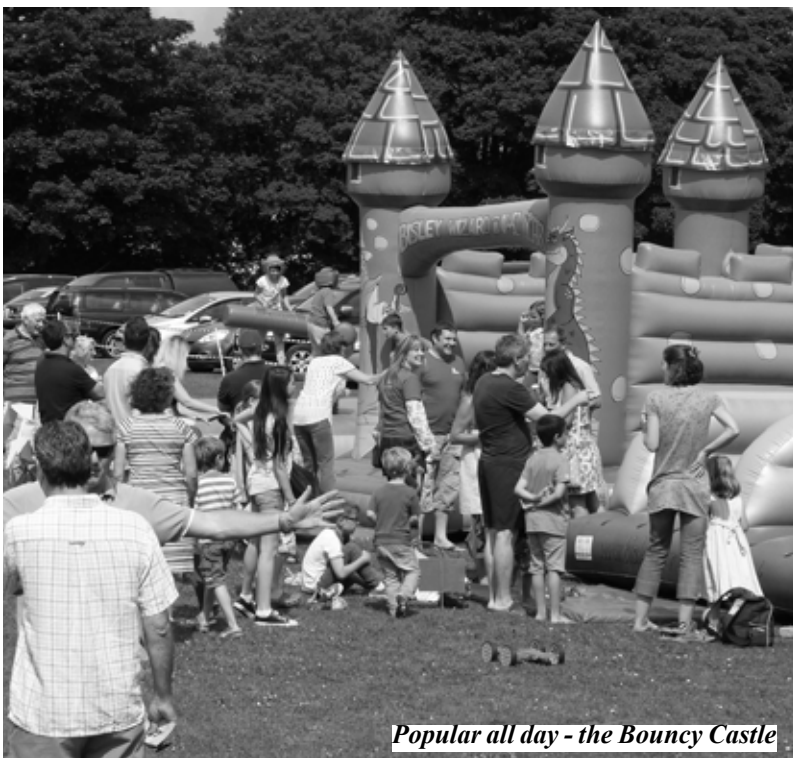
Popular all day - the Bouncy Castle