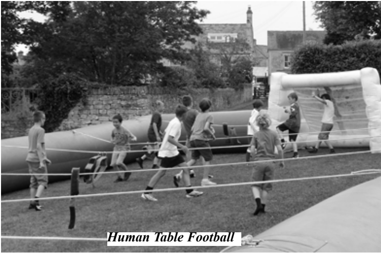
Human Table Football