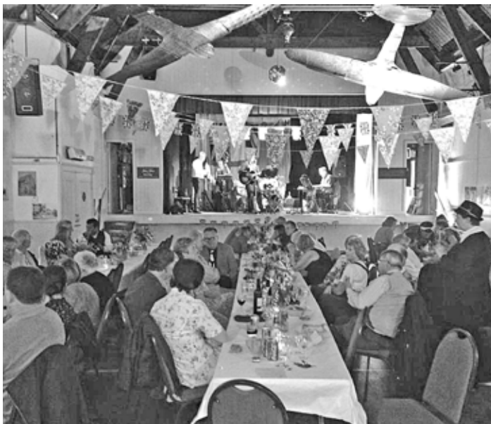
Photos of the Normandy 44 evening

Emergency out of hour's number 07769182229