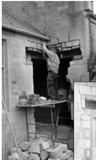
Some massive stones had to be manoeuvred into place and expertly fixed. The bottom photo shows one of the stone masons, Noel Gay, checking the mullion