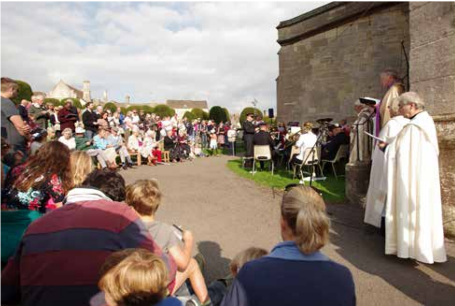
The Clypping Service