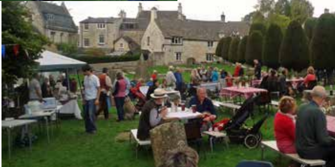
The Round Britain cycle race passing through Painswick