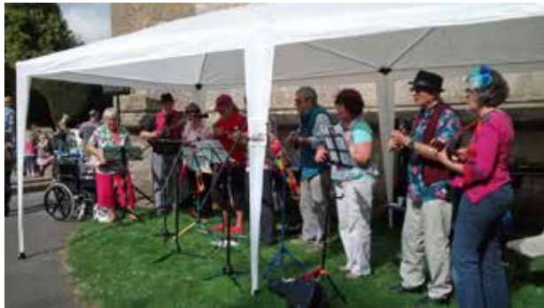
The Feast. Picnics, music and much more