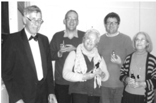
Joint runners-up The Fools on the Hill (top) and The high flyers (below)