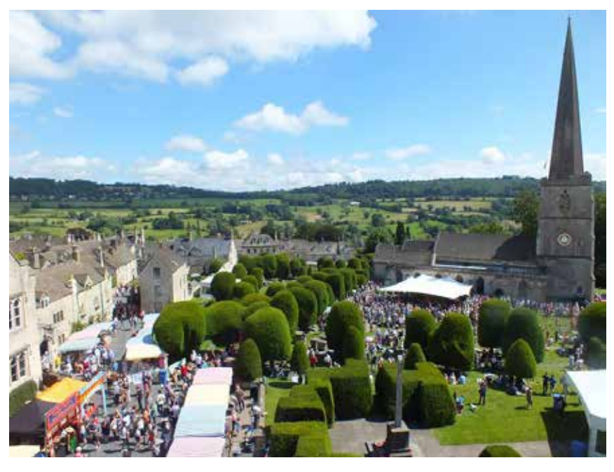
ACP FESTIVAL 2016