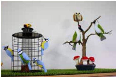
Knitted Garden produced by the Knit and Natter group is now on show in the Library