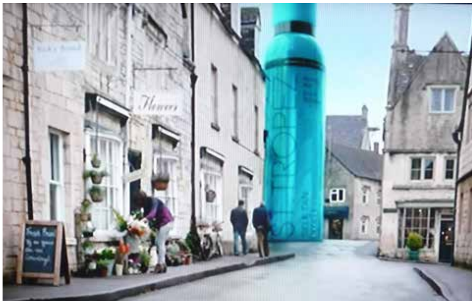
For those who do not watch much television this a picture taken from a Boots TV advertisement featuring Painswick as the background and one of their skincare products in the foreground

NEXT ISSUE Publication date SATURDAY August 5th 2017