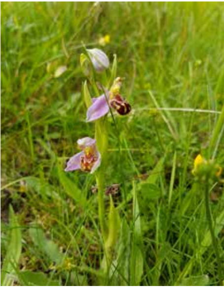
Bee Orchid found on the Beacon