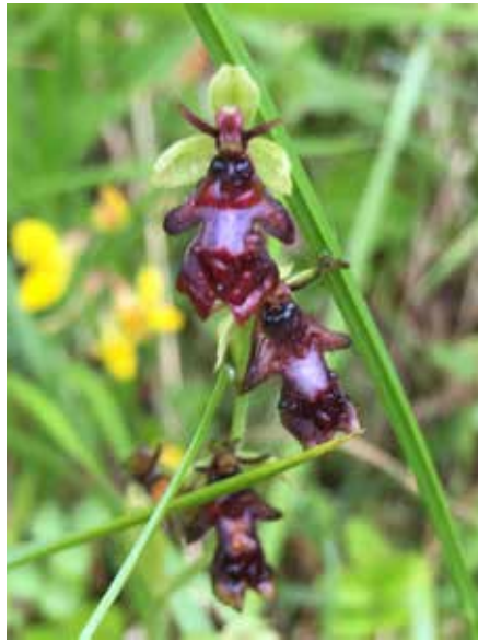
Fly Orchid found on the Beacon.