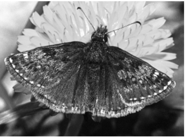
The Dingy Skipper butterfly

Woodland wild flowers come into their own in spring and Buckholt Wood has a wonderful variety of species. Join us for a walk through this ancient woodland and learn how to identify some of these beautiful plants. The walk is suitable for all ages and levels of knowledge and will take approximately 2 hours. Well-behaved dogs are welcome.