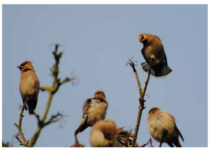
Waxwings on the Recreation Ground

Waxwings are small starling-sized birds with a prominent crest and colourful markings. They usually travel here from Siberia and northern Scandinavia only if they experience a particularly harsh winter or if there is a shortage of food. In Painswick they're a relatively rare sight, seen perhaps only once in five years or so. But across Britain they've been seen frequently this winter, according to the RSPB. They're often seen on trees covered with berries, including rowan and hawthorn.