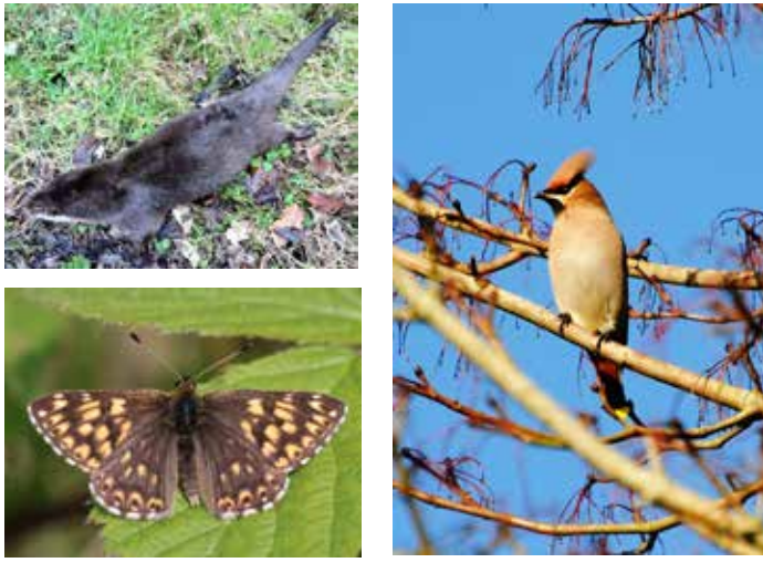
The Duke of Burgundy butterfly and (right) one of the waxwings

Anyone interested in spotting the Duke of Burgundy and other species, might like to join one of Natural England's Spring walks in the Cotswold Commons and Beechwoods National Nature Reserve (see page 11). The reserve covers the commons at Cranham, Sheepscombe and Edge (Rudge Hill) as well as the woods around Cranham and Sheepscombe, and is a valuable wildlife habitat on our doorstep.