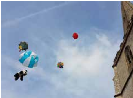
Many enjoyable activities at this year's Painswick Feast. Pictures from the Clypping Service on back page