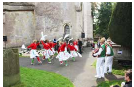
Flying Teddy Bears, Morris dancing, music provided by the Five Valleys Wind Band and the Apple Press