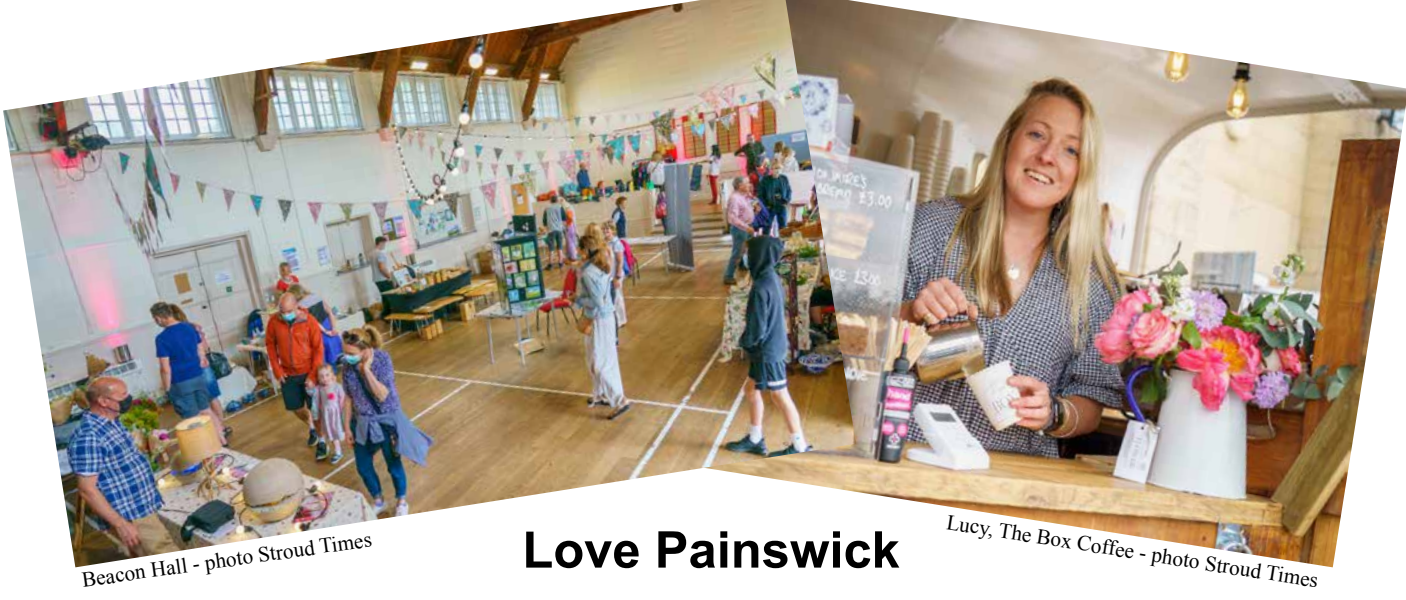
Beacon Hall