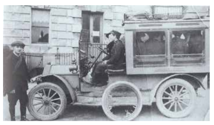
Herbert Ireland, left, with a motorised bus in New Street

To run the service Maurice Ireland needed to invest in a bus / coach and in horses, which he kept in Vicarage Street, by the Malt House next to the White Horse, while the bus was garaged in Bisley Street. where the Longfield Shop is now. One horse may have been enough to pull the bus in and out of Stroud, but to mount the hill to Painswick a second horse was required. That led to a terrible accident in 1898 when a visiting boy who had been allowed to ride the extra horse down to meet the bus, then fell off it and was crushed to death.