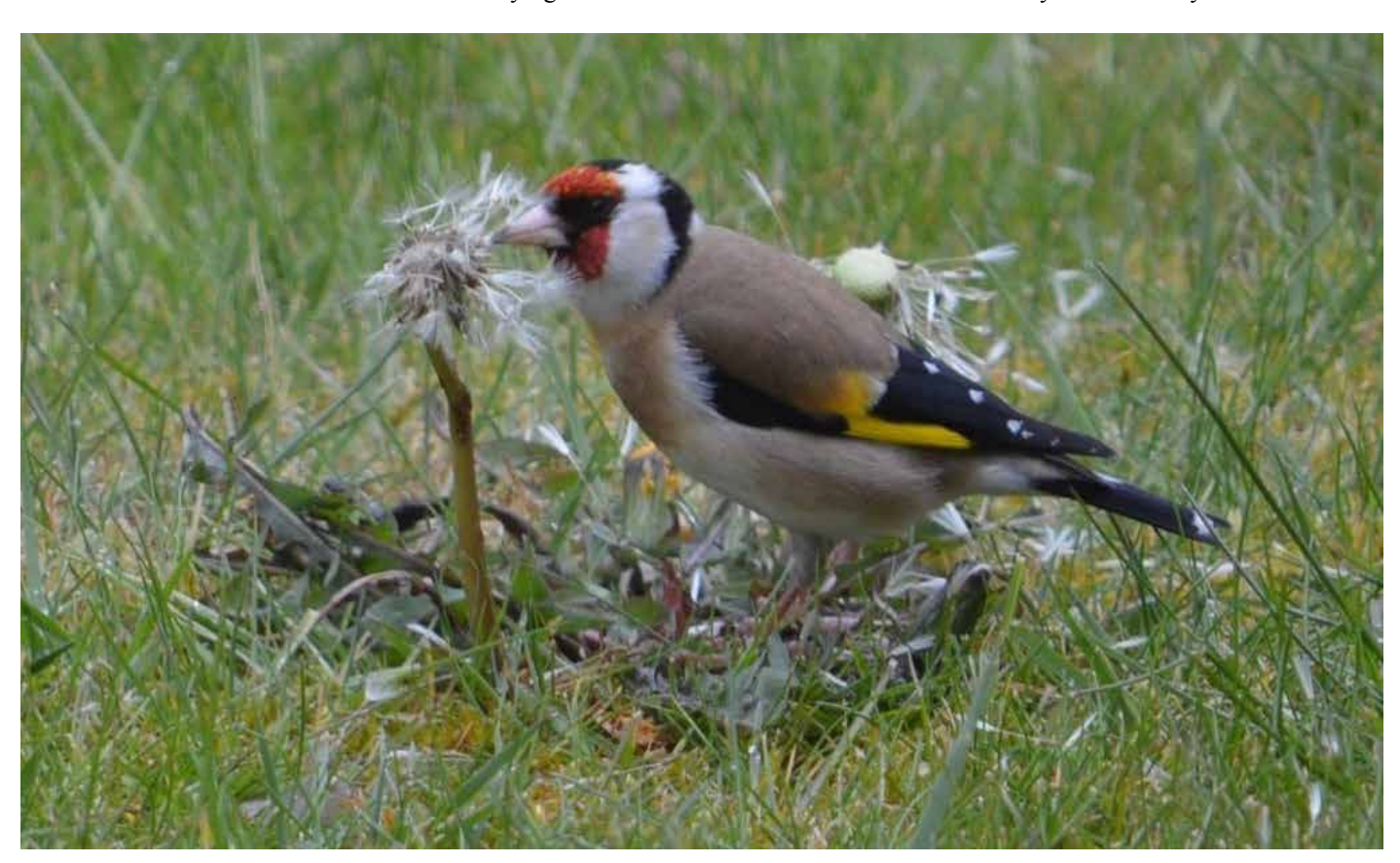
A Goldfinch at lunch, pictured recently in Painswick.