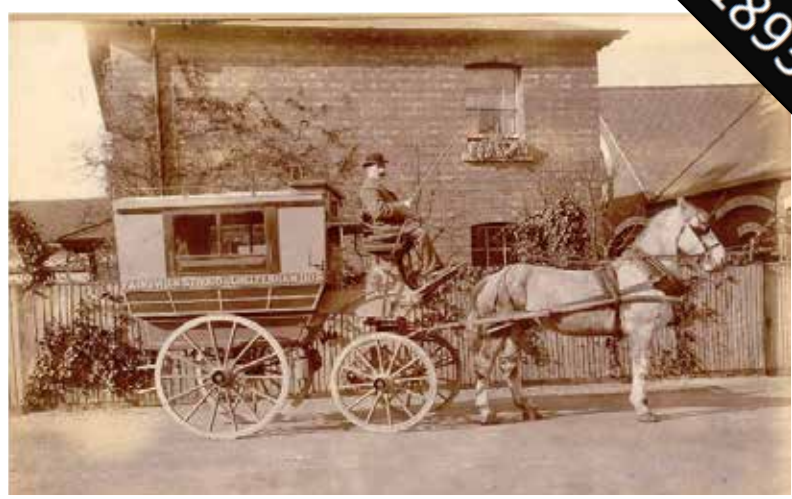
Maurice Ireland on an early horse-drawn bus

It was not the first local bus service and it wasn't a bus as we would know it today, being horse-drawn and looking rather more like a stage coach. But in the jargon of the day it was an 'omnibus', meaning for everyone, and it may have brought bus travel to Painswick within the means of many more people than the stage coaches of previous generations.