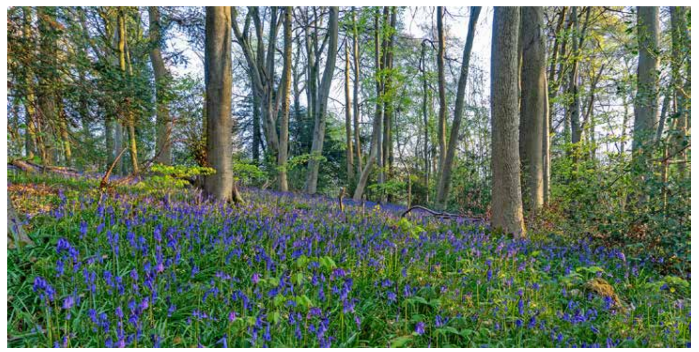
Bluebells bathed in the soft early light of sunrise in Frith Wood near Slad.