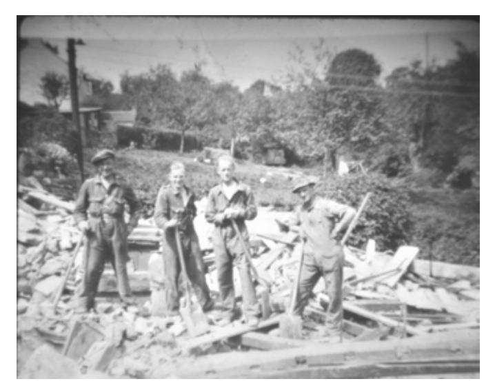
Clearing up the damage on Tibbiwell Now the site of Phoenix Cottage

For several years the site covering Friday Street through to St Mary's Street and The Cross was the subject of an ambitious idea to create a new shopping centre the plans for which were certainly ahead of their time. This idea was eventually abandoned and finally the proposal for what we now know as the Nurse's House in St Mary's Street was agreed and the building eventually completed in 1953. This is in fact Painswick's official WW2 war memorial.