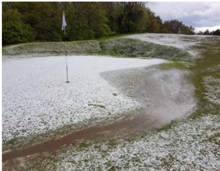
The 8th green for a brief period during the Seniors Open