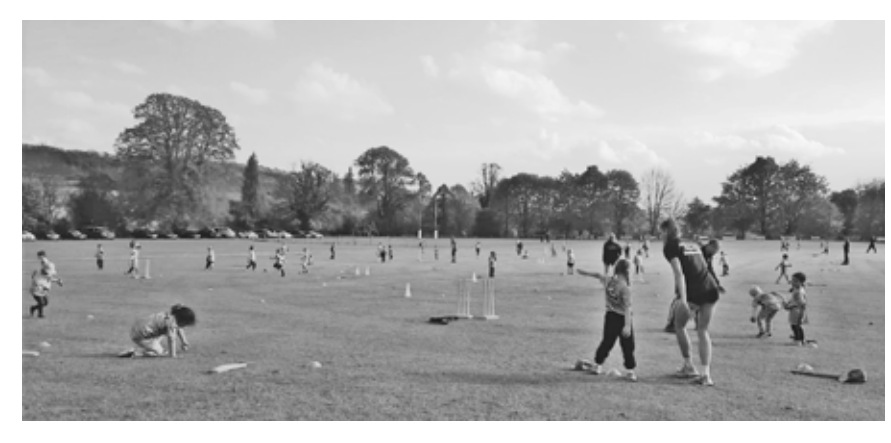
Broadham on a Friday evening