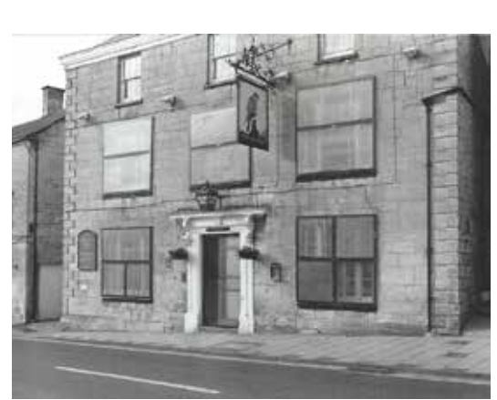
The Falcon boarded up in 1995 A view we hoped never to see again

The Falcon is a substantial business, with 11 bedrooms as well as the pub / restaurant side. It has been a significant employer in Painswick as well as an important social centre, and has been providing accommodation for visitors and refreshment for locals for probably well over 400 years, since Tudor times, although it was out of use and boarded up for a period in 1995.